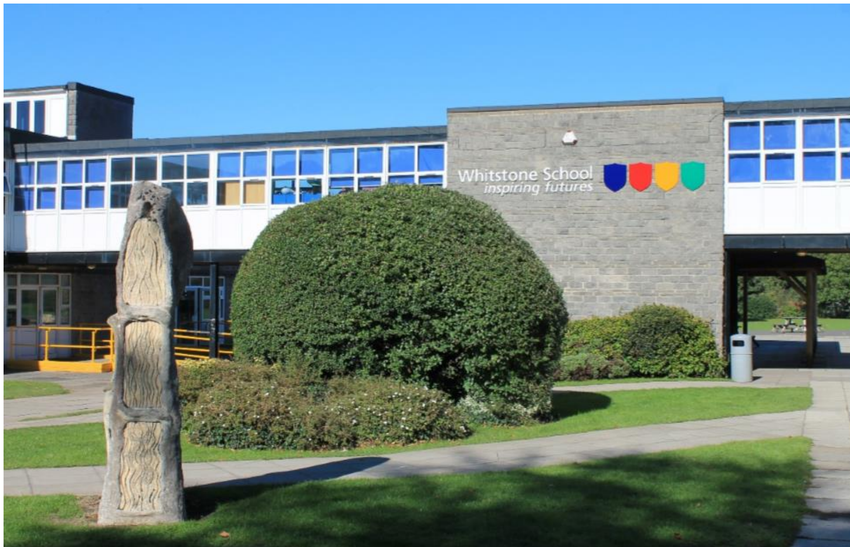
Whitstone School Improvement Plan 2021-22