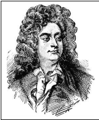
Henry Purcell 1659-1695

The composer, Benjamin Britten wrote a piece of music for orchestra called ' The Young Person's Guide to the Orchestra ' in order to educate young people about the different instruments in the orchestra. He based his piece on a theme from an older piece of music by a composer called Henry Purcell .