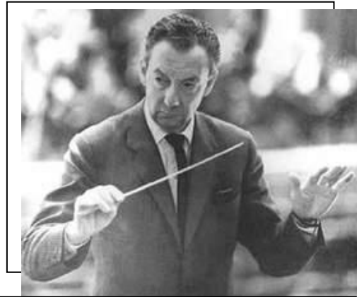
Benjamin Britten 1913-1976

We hear this theme at the very beginning of the piece played by the full orchestra. After that, Britten gives the listener a brief tour of the different sections of the orchestra.